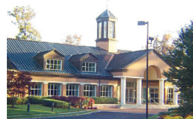
NJSBA's New Jersey Law Center, New Brunswick, NJ