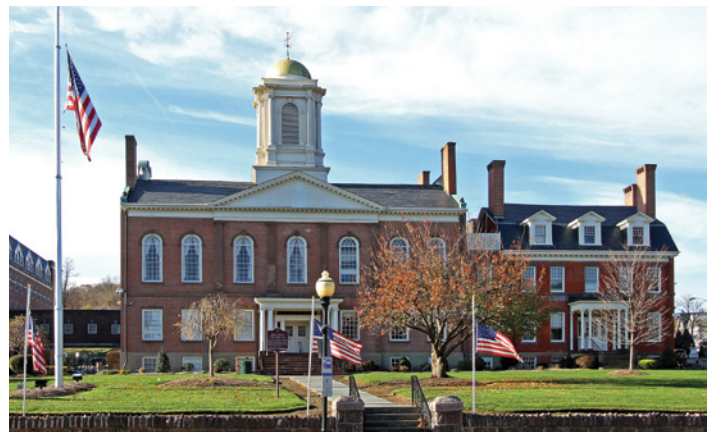
Morris County Courthouse, Morristown, N.J.